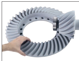
Extra wide face-width gearing provides greater strength for increased durability.