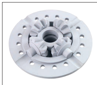
Larger wheel differential gearing means maximum strength and high power density.

For spec'ing or service assistance, call 1-877-777-5360 or visit our website at www.dana.com